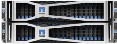
Figure 1) H410C/S compute and storage node.

NetApp is the data authority for hybrid cloud. We provide a full range of hybrid cloud data services that simplify management of applications and data across cloud and on-premises environments to accelerate digital transformation. Together with our partners, we empower global organizations to unleash the full potential of their data to expand customer touchpoints, foster greater innovation, and optimize their operations. For more information, visit www.netapp.com . #DataDriven